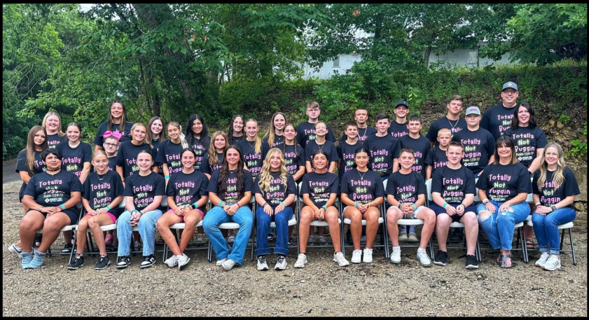
We had a great week at Falls Creek!

FIRST TIME VISITING? SCAN THE QR CODE TO BE DIRECTED TO OUR VISITORS FORM. LET US KNOW WHO YOU ARE!